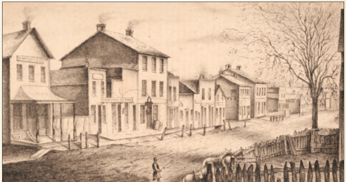
The first image of Oshawa to be published was released in 1847, artist unknown, from Smith’s Canadian Gazetteer (1846-47).